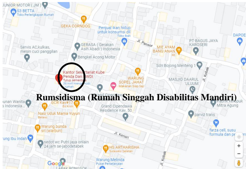
Gambar 1: Location of Rumsidisma: Bojong Menteng, Rawa Lumbu, Bekasi Jawa Barat